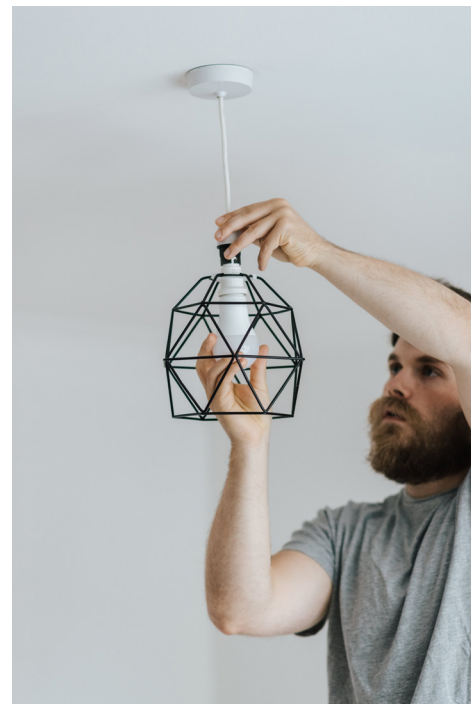
Installing smart bulbs throughout your home is as simple as installing a traditional bulb.

Whether you're looking for more convenience, colorful options or better ways to manage energy use, smart lighting can provide multiple benefits. Determine which smart lighting features are most important for your needs, then start shopping! ■