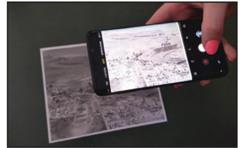
Capture historic photos with your smart phone camera.

The deadline to submit photos is August 31, 2018. For assistance or questions, the public can contact 509-737-6365, comm@midcolumbialibraries.org or stop by the West Richland library. ■